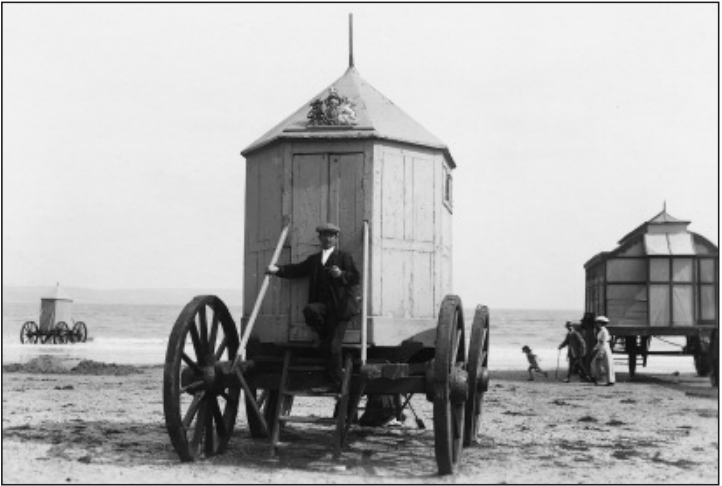
Above: An octagonal bathing machine believed to have been used by King George III, shown here on the sands around 1910. It is now in Weymouth Museum.