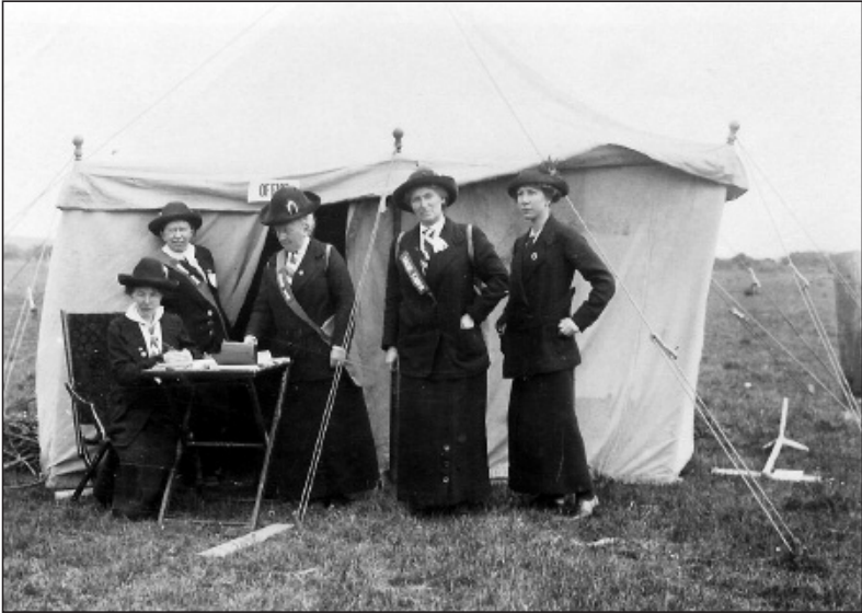
Suffragettes at their camp at Lodmoor in 1914.